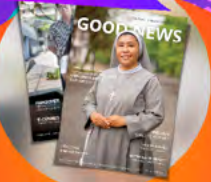
Good News Magazine