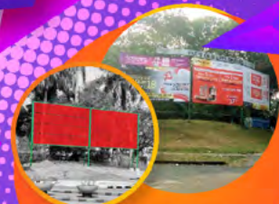
What's On Lippo Cikarang