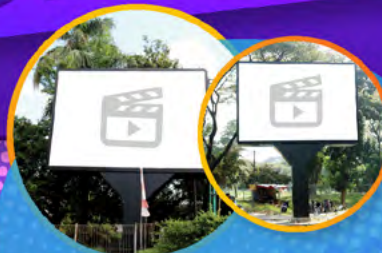
Videotron Digital Billboard